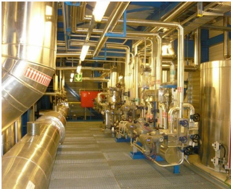
Boiler house in-view