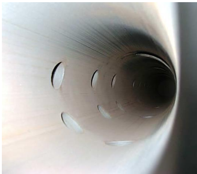
Inner surface of water-wall header