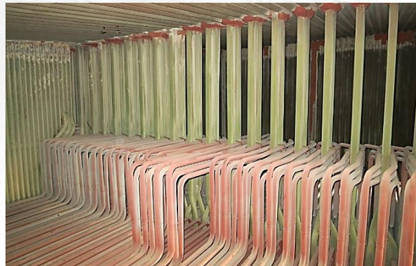
Intermediate pass – primary SH tubes