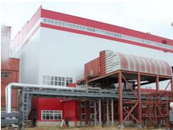
Heating plant view