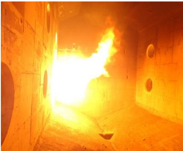
Boiler first fire

Design, manufacturing, site delivery, erection and commissioning of the whole power plant control system, boiler rehabilitation including complete new firing system, field instrumentation, electrical parts etc.