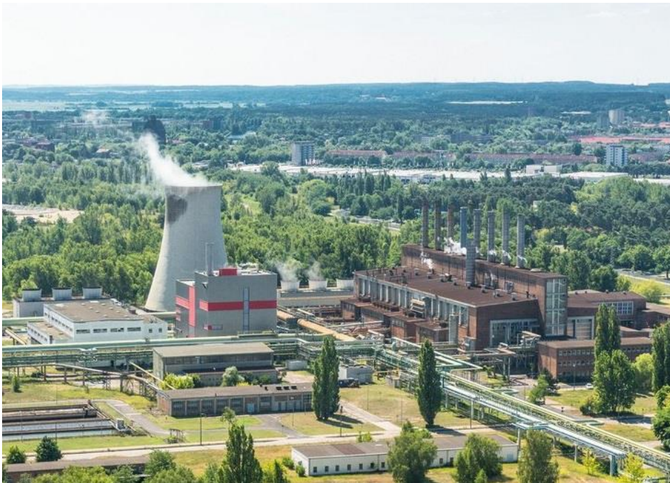
Existing heating plant

The plant replaces three old boilers and will substantially improve environmental measures and total plant efficiency.