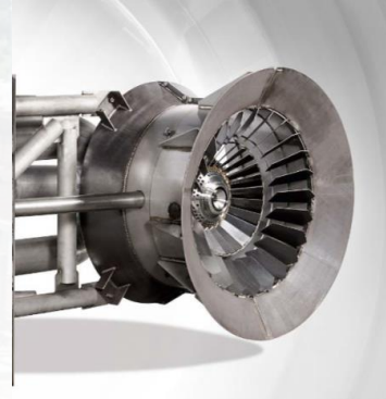
Special hybrid burners has been developed with partner company

Design, manufacturing, delivery, site advisory services and commissioning of the hybrid boiler including supplementary firing system, hüttengas preheating system, air fan, feed water system, flue gas recirculation fan and other supporting systems.